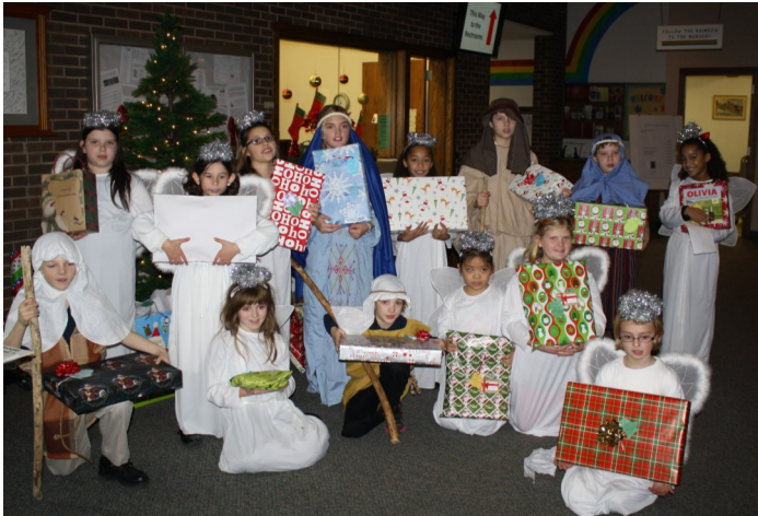
The children helped with the blessing of the toys and gifts on December 14th.

The mission committee will sponsor coffee hour on January 25th to benefit the Imagine No Malaria project. We appreciate your support! ~ The Mission Committee