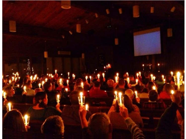
Nearly 300 people were present for Christmas Eve worship! Jesus is the Light of the world. Keep his light burning in your heart!