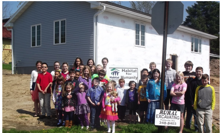
On Sunday, May 18th, the Sunday School students went to visit the Habit for Humanity house that they have been raising money to build. They were so excited to see the house and how far it has come.

Our mission project for the year was to support Grant County Habitat for Humanity. Students brought in their quarters and dollar offerings each week, sponsored bakes sales each month, and decorated and sold wooden houses at Christmas to financially support the house building. On the weekends that our church members worked on the house, some of our youth helped prepare and serve the workers lunch. Our young people have raised $5815.00 this year for Grant County Habitat for Humanity. 90% of that money will go to the Grant County project, and 10% will be used to build houses in Malawi, Africa.